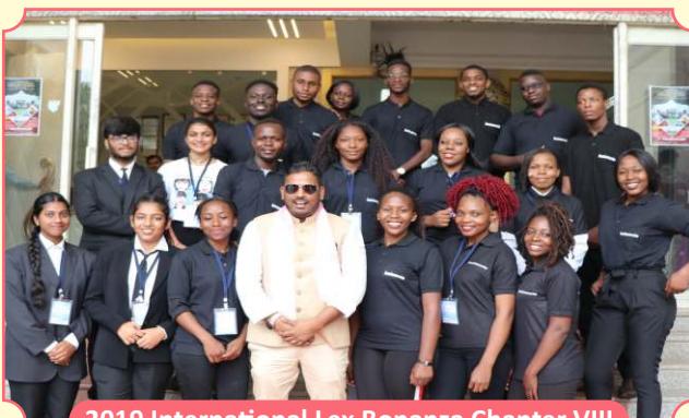
2019 International Lex Bonanza Chapter VIII