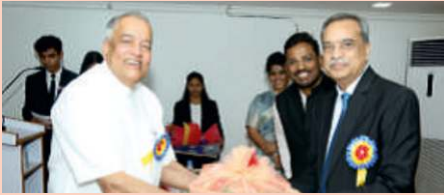
Hon'ble Justice M. R. Shah Former Judge Supreme Court of India Smt. Nirmala Devi Bam Memorial Moot Court Competition 19 to 21 May 2023