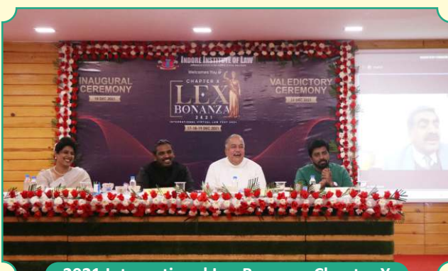
2021 International Lex Bonanza Chapter X