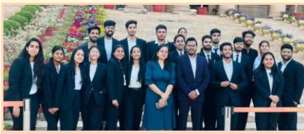
New Parliament visit 4 March 2024