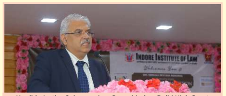
Hon'ble Justice Subramonium Prasad Judge, Delhi High Court Smt. Nirmala Devi Bam Memorial Moot Court Competition 19 May 2024