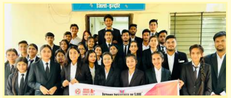
Rajkeey Bal Sanrakshan Ashram Indore 18 April 2024