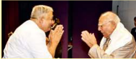
Mr. Ram Jethmalani, MP, Sr. Adv. Supreme Court of India The National Symposium on Money Laundering Regulations – A Tool to Curb Corruption in India, 14 April 2012