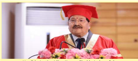
Hon'ble Justice Vijay Kumar Shukla Judge of the High Court of Madhya Pradesh Graduation Ceremony - 24 February 2024