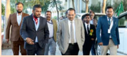
Hon'ble Justice J. K. Maheshwari Judge Supreme Court of India Lex Bonanza International Law Fest - Date 09 to 11 Dec. 2022