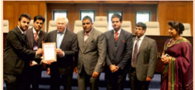
Certification BY HAGUE UNIVERSITY NETHERLANDS on International Private & Public Law