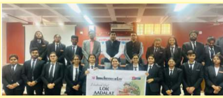
Lok Adalat Visit - High Court Indore M.P. 24 February 2024