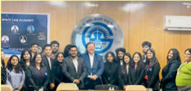
Credit Certification Program on Air & Space Law at Gujarat National Law University in collaboration with University of Cologne Germany