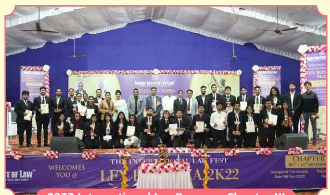
2022 International Lex Bonanza Chapter XI