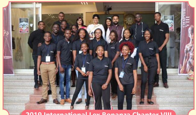
2019 International Lex Bonanza Chapter VIII