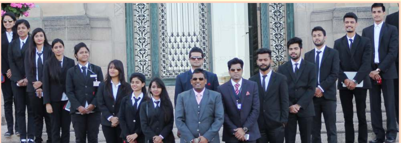
INTERNATIONAL EDUCATIONAL VISIT International Court of Justice. (ICJ) Hague, Netherlands