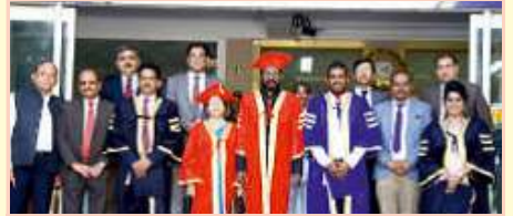
Hon'ble Justice C.T. Ravi Kumar, Judge Supreme Court of India Graduation Ceremony - 18th February 2023