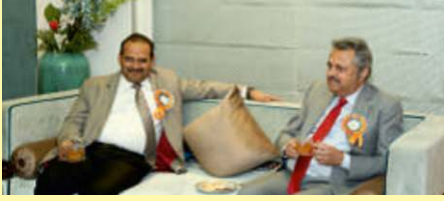
Hon'ble Justice Ravi Malimath, Chief Justice of Madhya Pradesh High Court Lex Bonanza International Law Fest - Date 09 to 11 Dec. 2022