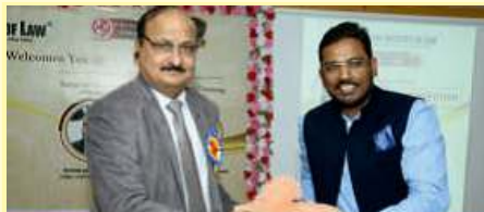
Hon'ble Justice Anil Verma Former Judge Supreme Court of India Smt. Nirmala Devi Bam Memorial Moot Court Competition 21 May 2023