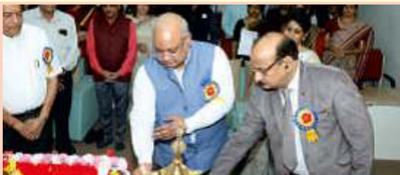
Hon'ble Justice. Dinesh Maheshwari Former Judge Supreme Court of India - Smt. Nirmala Devi Bam Memorial Moot Court Competition - 21 May 2023