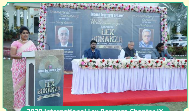
2020 International Lex Bonanza Chapter IX