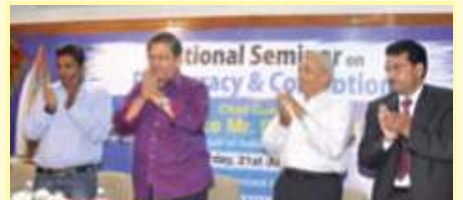
Hon'ble Justice Santosh Hegde The National Symposium on Democracy & Corruption 21st July 2012