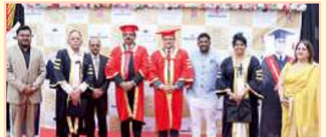
Hon'ble Justice Abhay S. Okas Judge Supreme Court of India Graduation Ceremony 14th October 2023