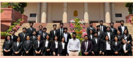
Supreme Court Visit 5 March 2024