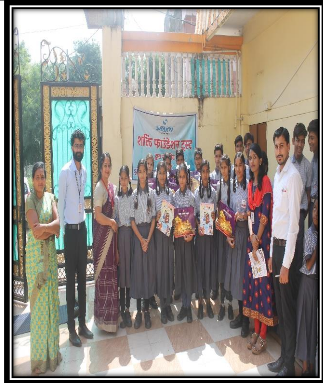
Seminar on Know your Constitution at UmiyaPatidar School, Rangwasa