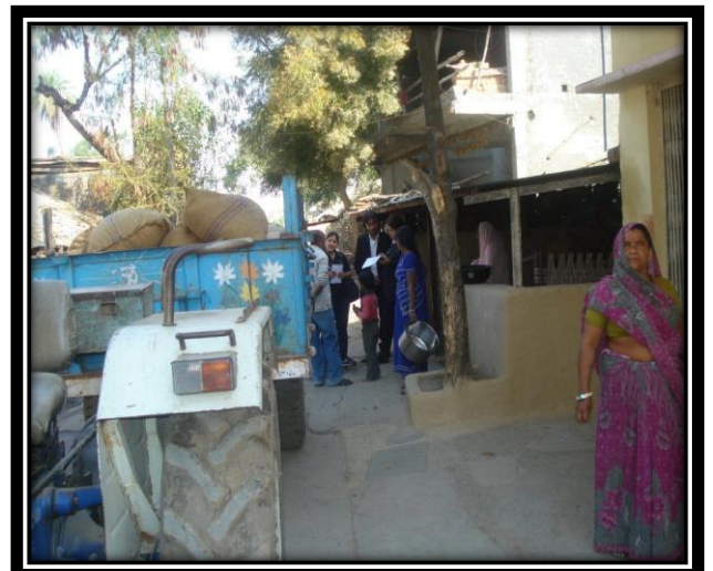
Free Legal Aid Camp & Adoption of Umerikheda Village