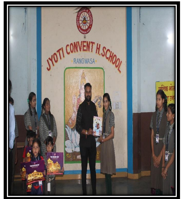
Seminar on Know your Constitution at Jyoti Convent High School, Rangwasa