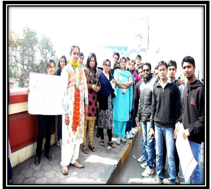
Students and Staff in the Rally