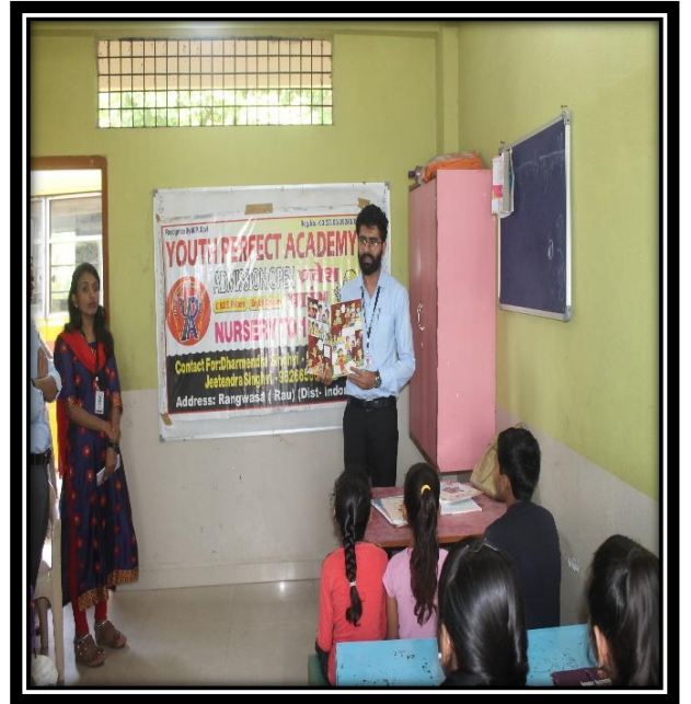
Seminar on Know your Constitution at Youth Perfect Academy, Rangwasa