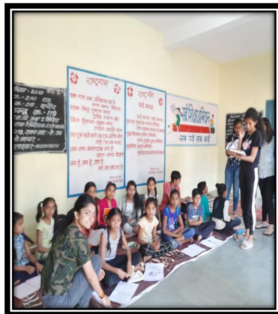
Seminar on Know your Constitution at Government Primary School Sindoda