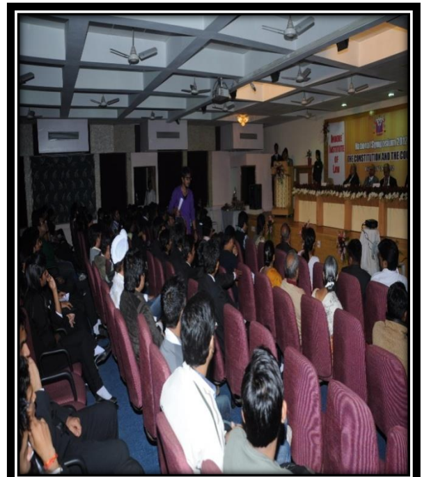
National Seminar on the Constitution & the Courts'