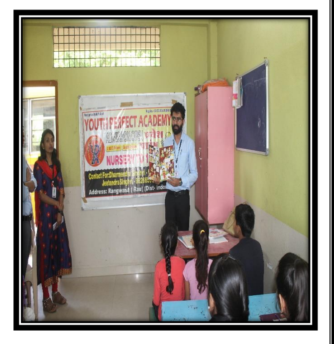
Seminar on Know your Constitution at Youth Perfect Academy, Rangwasa