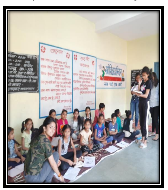
Seminar on Know your Constitution at Government Primary School Sindoda