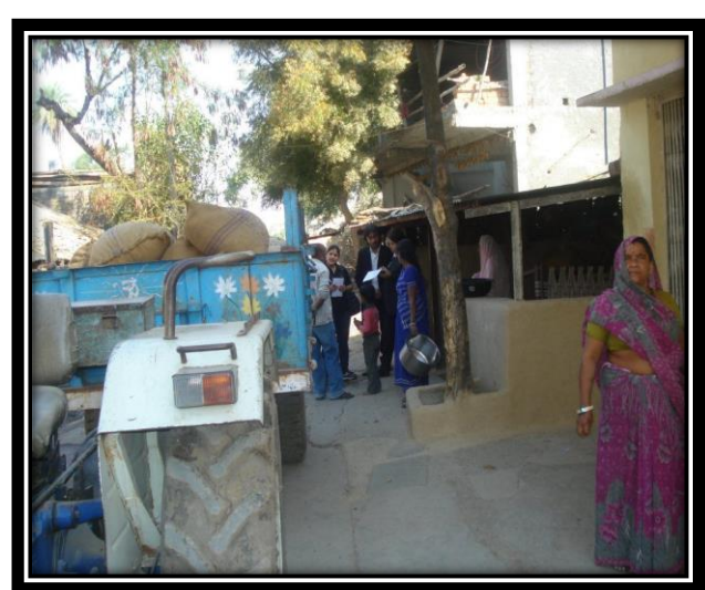
Free Legal Aid Camp & Adoption of Umerikheda Village