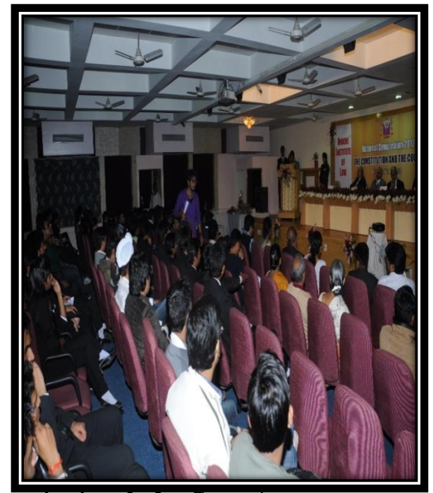
National Seminar on the Constitution & the Courts'