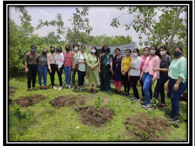
Plantation Drive at Sindhoda Village