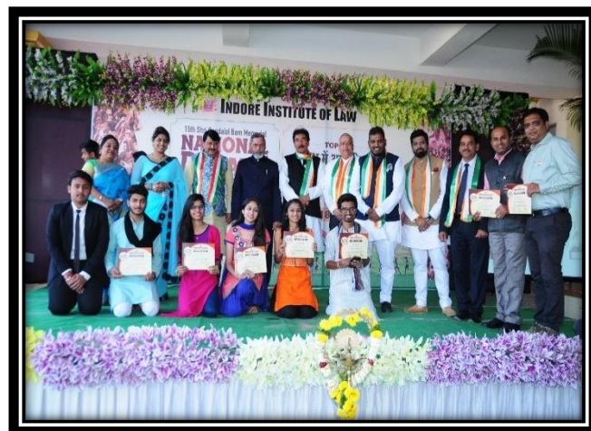
Participants & Winners with Guests at National Debate Competition