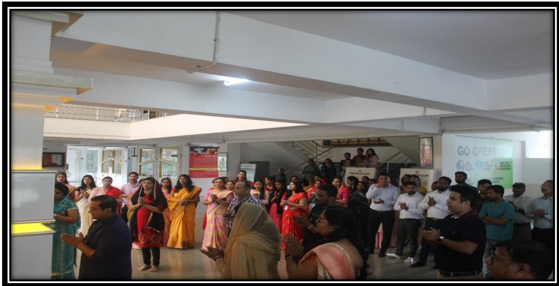
Holi Celebration at INDORE INSTITUTE OF LAW