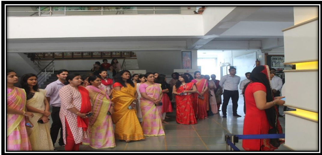
Lohri Celebration at INDORE INSTITUTE OF LAW