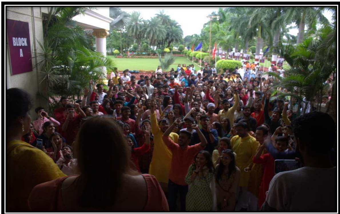
Diwali Celebration at INDORE INSTITUTE OF LAW

This was how the students came together and celebrated the important days and festival of harvesting and togetherness.