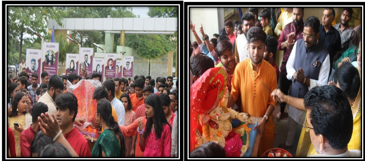
Ganesh Utsav Celebrated at IIL

Ganesh Visarjan: The Immersion Ceremony on date 23 rd September 2018” Ganesh Chaturthi is the Hindu festival celebrated in honor of the god Ganesh, the elephantheaded, remover of obstacles and the god of beginnings and wisdom. This was how the students came together and celebrated the important days and festival of harvesting and togetherness.