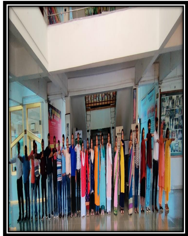
Sadbhavna Diwas Celebration