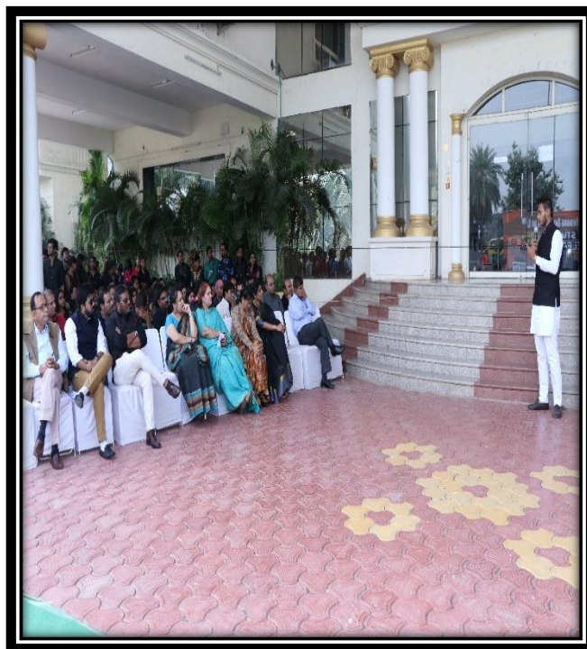
Students Performing Role Play Exercise on World Ethics Day