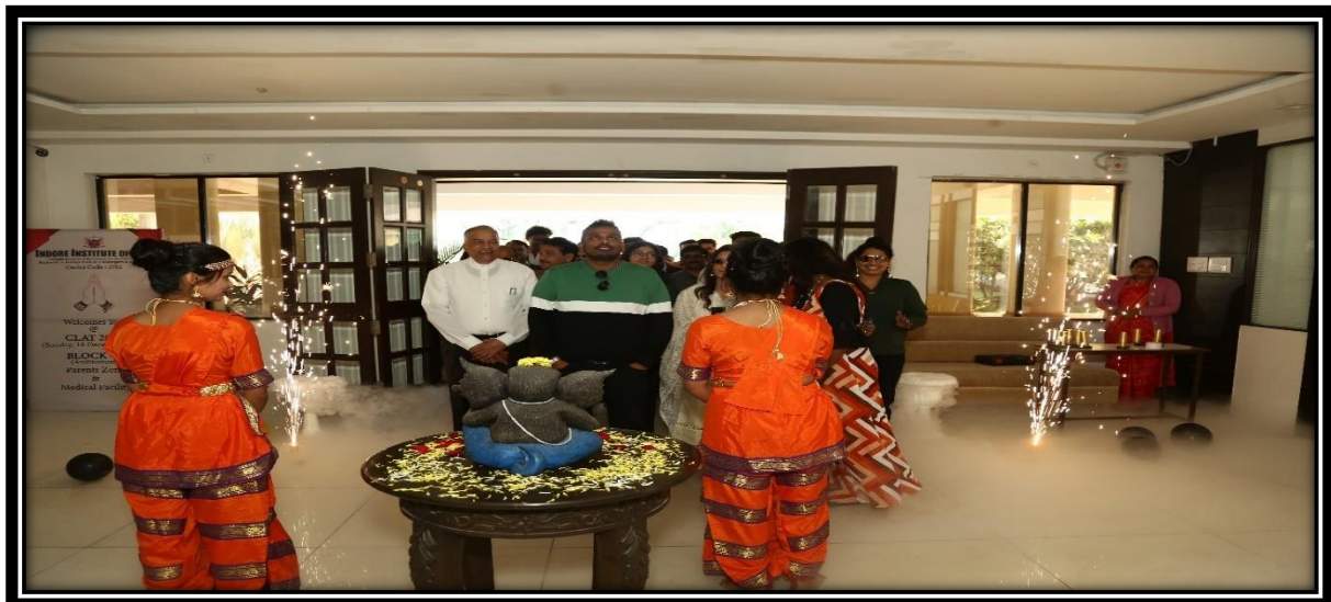
Christmas Celebration at INDORE INSTITUTE OF LAW