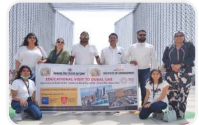
Visit to World Expo, Dubai, UAE