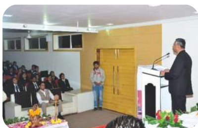
Lawyers Conclave Series Expert Lectures by Veteran Law Professionals