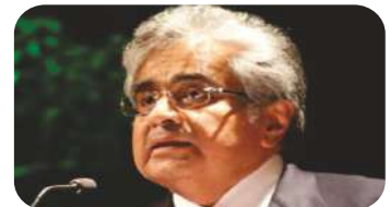
Adv. Harish Salve Sr. Adv., Supreme Court of India