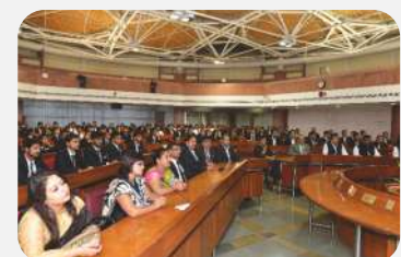
Seminar at Parliament of India