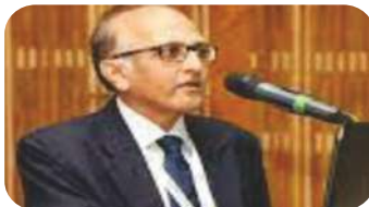
Hon'ble Justice Ravindra Bhatt Judge, Supreme Court of India