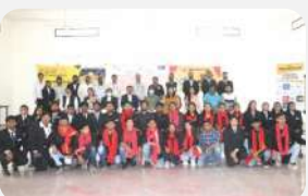
Legal Aid Camp