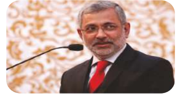
Hon'ble Justice Joseph Kurian Judge, Supreme Court of India