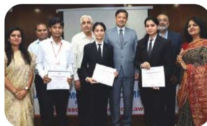
Certification on Legal Research by Knowledge Steez