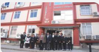
Visit to M.P. High Court