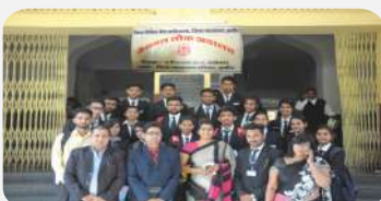
Visit to Lok Adalat