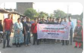
National Service Scheme (N.S.S.)