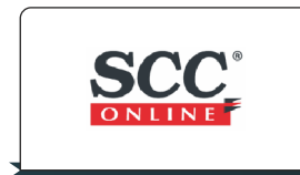
Supreme Court Cases (SCC) Online