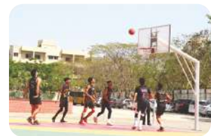
Basket Ball Tournament