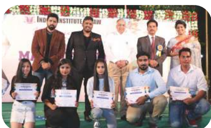
Certification on Digital Marketing by My Skills Pvt. Ltd.