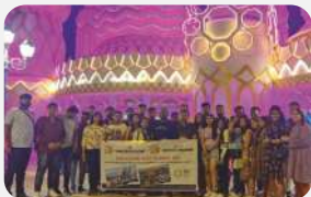
Global Village, Dubai