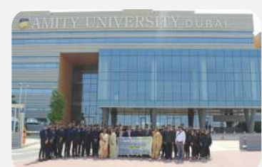
IIL Students at Amity University, Dubai, UAE