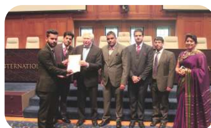
Certification on International Private & Public Law by Hague University, Netherlands