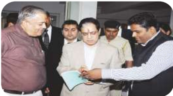
Hon'ble Justice Arjan Kumar Sikri Judge, Supreme Court of India