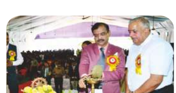
Adv. Ujjwal Nikam Special Public Prosecutor