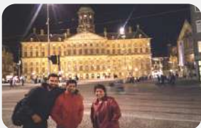
Royal Palace, Amsterdam