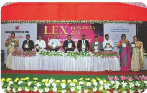
Udgam Vigyati Law & Management E-Journal - ISSN No. 2455-2488 Since 2015