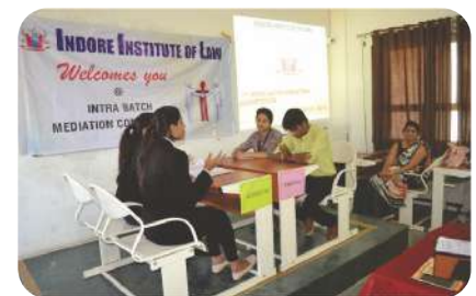
Online Society conducted Mediation Competition for imparting Negotiating Skills