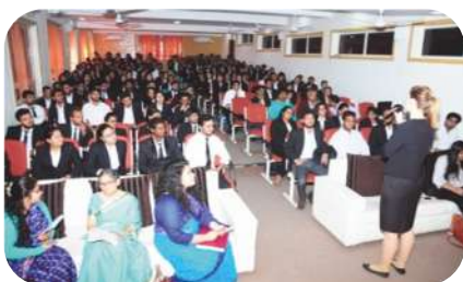
Certification of Foreign Language (French)