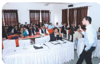
Guiding Lamp Series Career Guidance by Ex-IIIians