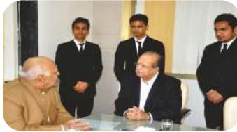
Hon'ble Justice A. S. Ganguly Judge, Supreme Court of India