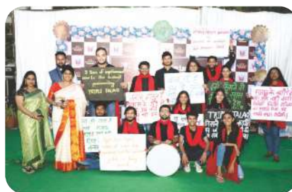
Street Play by Legal Aid Society for Creating Social Awareness