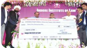
Hon'ble Justice Altamas Kabir Chief Justice of India