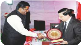
Hon'ble Justice Dipak Misra Chief Justice of India