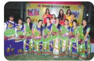
Garba Day Celebration