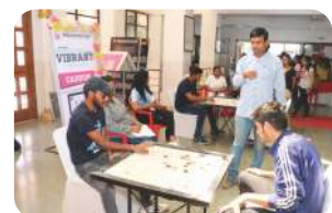
Vibrant: Sports Fest