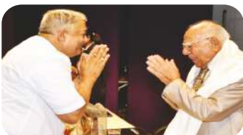
Adv. Ram Jethmalani Sr. Adv., Supreme Court of India & Member of Parliament (Rajya Sabha)