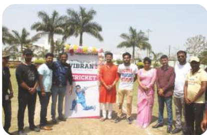
Sports Society promoting various sports.