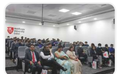
Visit to Middlesex University, Dubai, UAE