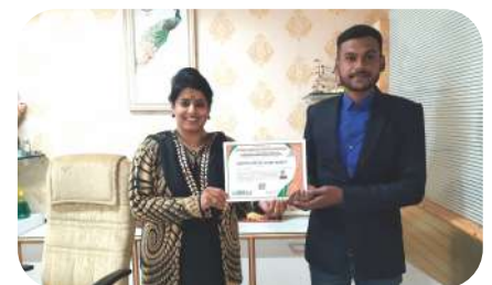
Diploma in Computer Application (DCA)