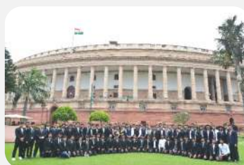
Visit to Parliament of India