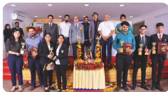
Alternate Dispute Resolution Competition