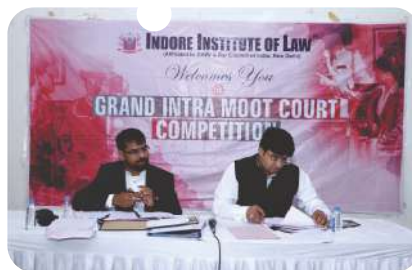
Moot Court Society engaged in the most crucial part of Law education, demonstrating court proceedings.