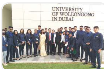
Visit to University of Wollongong, Dubai, UAE