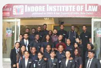
Students from Nigeria & Zimbabwe at IIL