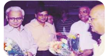
Padma Vibhushan Justice V. N. Khare Chief Justice of India