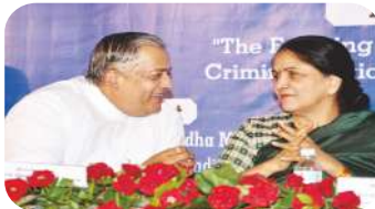
Hon'ble Justice Gyan Sudha Mishra Judge, Supreme Court of India