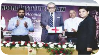
Justice Markenday Katju Judge, Supreme Court of India