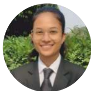
MADHU KAVERI THUKRAL LAW ASSOCIATES, NEW DELHI