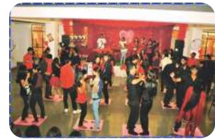
Red Day Celebration