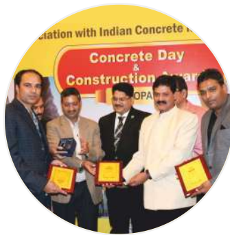
Best Concrete Structure in Private Sector Constructions Award in 2014 by Ultra Tech