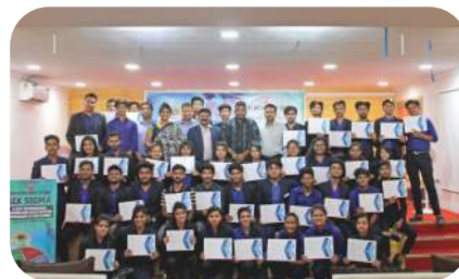
Six Sigma Certification 7 day International Training & Certification Program