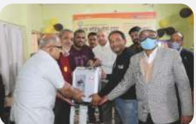
Old Age Home Visit