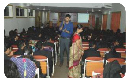
Knowledge Series Subject Enlightenment by Subject Experts