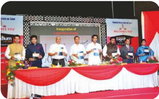
The Legal Voice of India "Law Journal" - ISSN No. 2277-8454 Since 2012