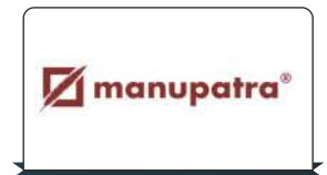
Manupatra Online Data Base