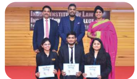
Certification on Mooting & Memorial Making by Memo Pundit