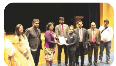
Certification on Global Marketing by Amity University, Dubai, UAE