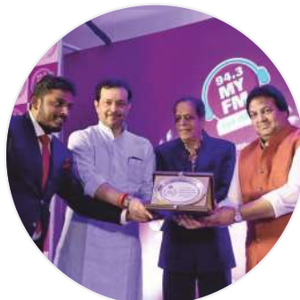
Entrepreneur of the Year Award 2016 Awarded by 94.3 My FM, Indore