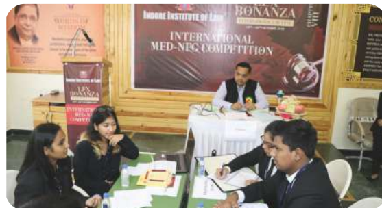
Mediation & Negotiation competition