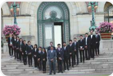
Visit to International Court of Justice (ICJ), Hague, Netherlands