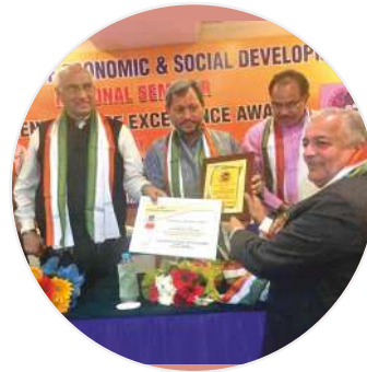
Recipient of Rashtriya Siksha Ratan Award 2017 by Global Achievers Foundation