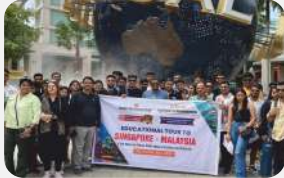
Universal Studio, Singapore