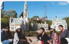
Mini Europe, Belgium