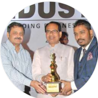
Recipient of Captains of Industry Award by the Chief Minister of M.P., Mr. Shivraj Singh Chouhan in 2015