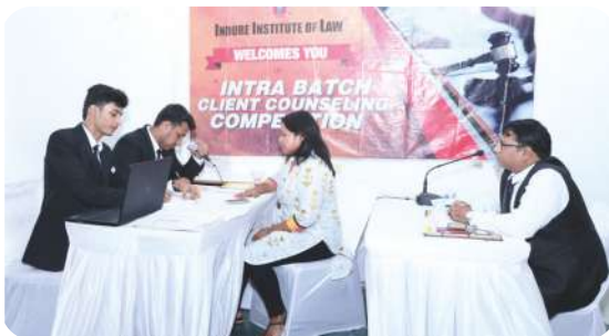
Client Counseling Competition

Demonstrative Learning provides better learning experience in the classroom for students. It generates interest of students in the Subject and helps in developing the spirit of inquiry in them. It further enriches student's understanding of the Law Subject & its applicability via various Subjective Competitions. Further it helps the student in having a deeper understanding of the topic which leads to permanent learning invoking principles of reflective thinking.