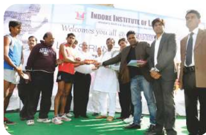
Marathon organized by the Disciplinary Society for Creating Awareness about Social Duties