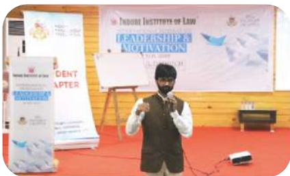
Certification on Leadership & Motivation by Indore Management Association (IMA) Activity Student Chapter