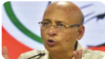
Dr. Abhishek Singhvi Sr. Adv., Supreme Court of India & Member of Parliament (Rajya Sabha)