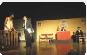
Theatre Play on Euthanasia