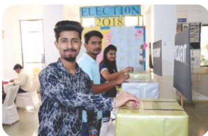
Election Commission doing Electoral Activities