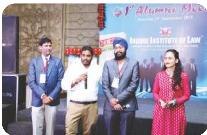
Alumni meet organized by Alumni Society to give its aluminums a heads count.