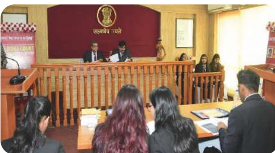
Moot Court Competition