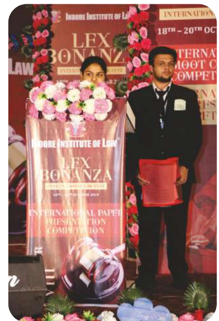
Literary Society conducted Research Paper Competition for hornng Research Skills