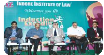
Hon'ble Justice S.S. Nijjar Judge, Supreme Court of India