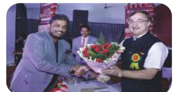
Adv. Vivek Tankha Sr. Adv., Supreme Court of India & Member of Parliament (Rajya Sabha)