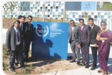
Visit to International Criminal Court (ICC), Hague, Netherlands