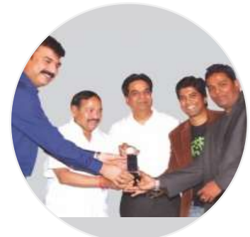
My FM/IDA Reality King awards for Best Educational Building of Central India Consecutively in the Year 2012-2013, 2014-2015