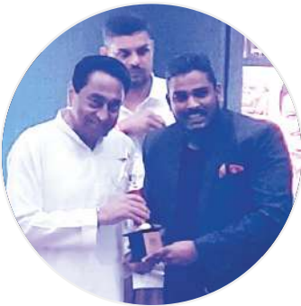
Recipient of ICONS of Madhya Pradesh by OUTLOOK Magazine for Extraordinary Contribution in Education by the Chief Minister of M.P., Mr. Kamalnath in 2019