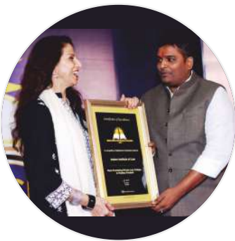
Education Excellence Award 2015 for The Most Promising Law College in M.P. by Brands Academy