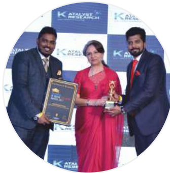
Excellence in Indian Education Awards 2016 for Best Brand of the year by Actress Mrs. Shamila Tagore