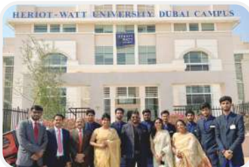
Visit to Heriot - Watt University, Dubai, UAE