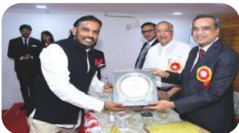
Hon'ble Justice M. R. Shah Judge, Supreme Court of India