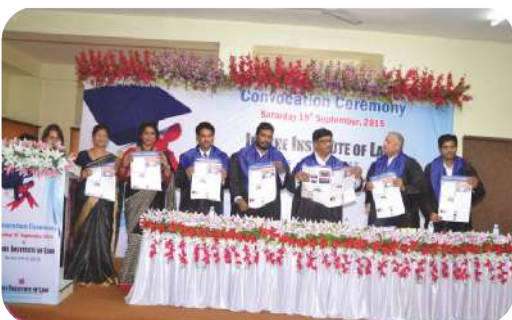
Nyaya Dishaa Monthly News Letter Since 2015