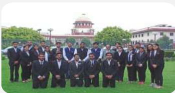
Visit to Supreme Court of India