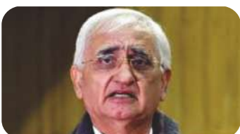
Adv. Salman Khurshid Sr. Adv., Supreme Court of India Former Cabinet Minister