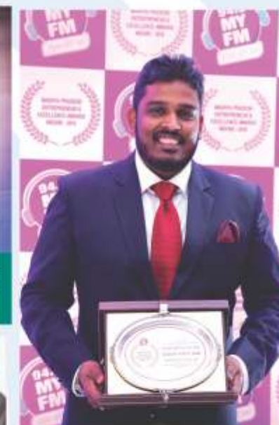
Entrepreneur of the Year Award 2016