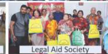
Legal Aid Society