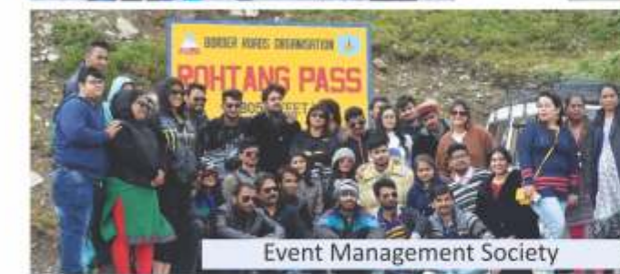
Event Management Society