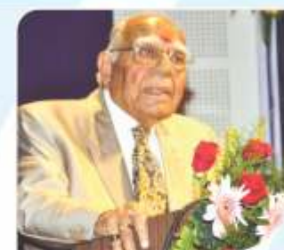
Sr. Adv. Ram Jethmalani Member of Parliament & Sr. Adv., Supreme Court of India