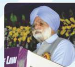
Adv. K. T. S. Tulsi Sr. Adv., Supreme Court of India