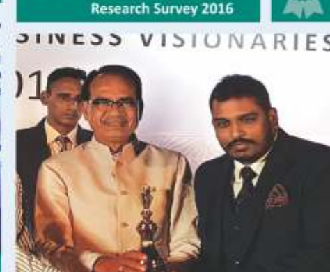
Recipient of Captains of Industry Award by Chief Minister of MP Sh. Shivraj Singh Chouhan