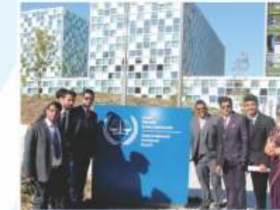
International Criminal Court Hague, Netherlands