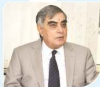
Hon'ble Justice S.S. Nijjar Judge, Supreme Court of India