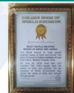
India's only Law College which created world record in Golden Book of World Records USA for conducting Animal Moot Court