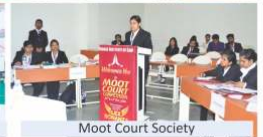
Moot Court Society