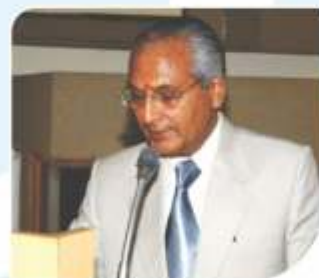
Hon'ble Justice S.L. Kochar Judge, High Court of M.P.