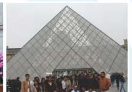
Louvre Museum, Paris