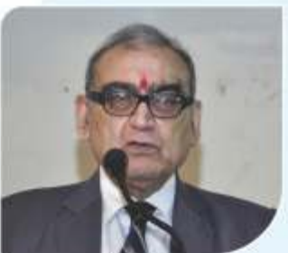
Hon'ble Justice Markandey Katju Judge, Supreme Court of India