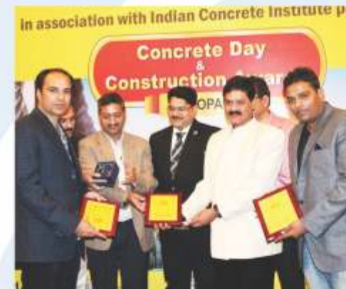
Best Concrete Structure in Private Sector Constructions Award 2014 by UltraTech