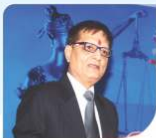
Hon'ble Justice M.L. Tahaliyani Judge, High Court (Bombay) FINAL VERDICT OF KASAB'S CASE