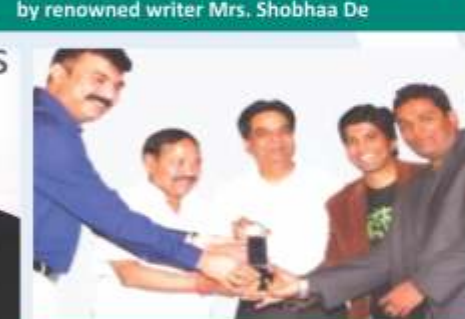
My FM/IDA Reality Kings Award for Best Education Building of Central India for Consecutive Years 2012 & 2013