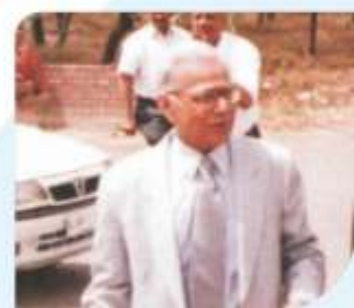
Hon'ble Justice V.N. Khare Former Chief Justice of India