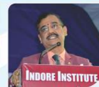
Adv. Ujjwal Nikam Special Public Prosecutor