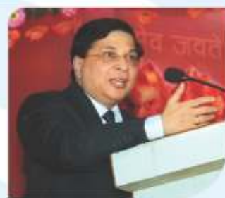
Hon'ble Justice Deepak Misra Judge, Supreme Court of India