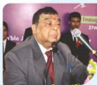
Hon'ble Justice Altamas Kabir Former Chief Justice of India