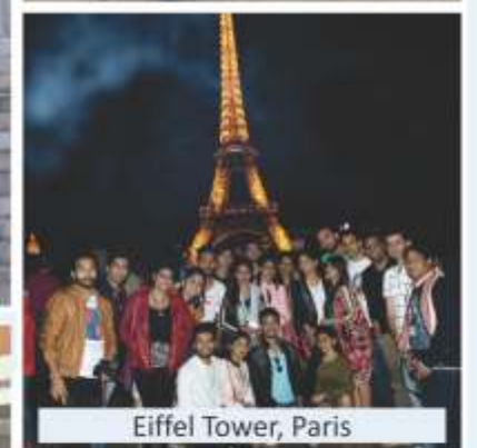
Eiffel Tower, Paris