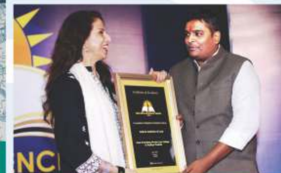
Excellence Award 2015 for the Most Promising College in Madhya Pradesh by Brands Academy by renowned writer Mrs. Shobhaa De