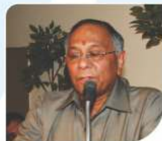
His Excellency V.S. Kokje Governor, Himachal Pradesh