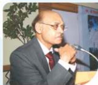
Hon'ble Justice P.P. Naolekar Judge, Supreme Court of India