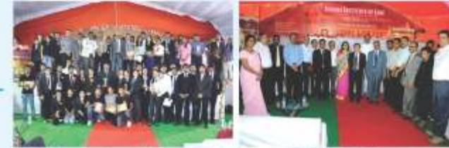
Hon'ble Justice Deepak Verma, Judge, Supreme Court of India Hon'ble Justice Deepak Misra, Judge, Supreme Court of India