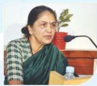
Hon'ble Justice Gyan Sudha Mishra Judge, Supreme Court of India