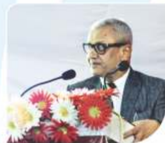
Hon'ble Justice Deepak Verma Judge, Supreme Court of India