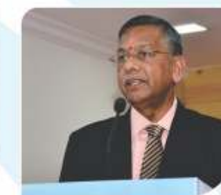
Adv. R Venkatramani Sr. Adv., Supreme Court of India Member, Law Commission of India