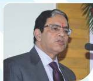
Hon'ble Justice A.K. Sikri Judge, Supreme Court of India