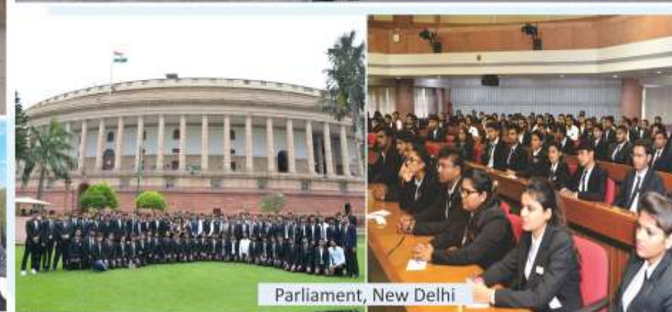
Parliament, New Delhi