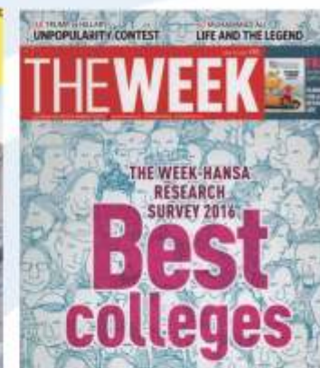
13th Rank in Top Law Colleges in India & 5th Rank in West Zone by the Week Hansa Research Survey 2016