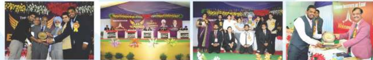
Mr. K.T.S. Tulsi Sr. Adv., Supreme Court of India