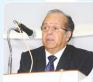
Hon'ble Justice A.K. Ganguly Judge, Supreme Court of India