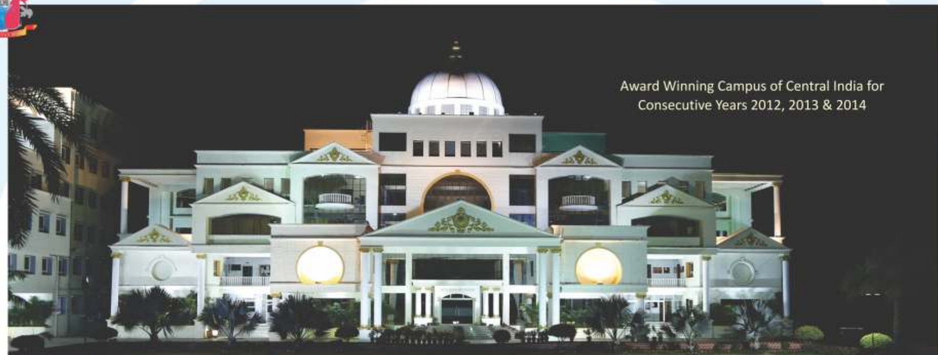
Award Winning Campus of Central India for Consecutive Years 2012, 2013 & 2014

Icon Education Society (I.E.S), as a first step to achieve its objectives, decided to set up an exclusive and independent college to provide specialized, high quality Legal education for professionals, coupled with all basic infrastructure facilities. Indore Institute of Law is the first independent & exclusive College of Law in Indore, Affiliated to the Bar Council of India & Devi Ahilya Vishwavidyalaya (DAVV), Indore. The study Course/Admission/Examination and Degree shall be strictly in terms of regulations of DAVV, Indore and BCI, New Delhi. Indore Institute of law is only private college in Madhya Pradesh where all the law courses run under one roof.