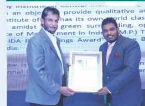
Recipient of Best Private Law College of the year 2016 M.P. by Mr. Sandeep Patil Ex Cricketer & Chief Selector BCCI