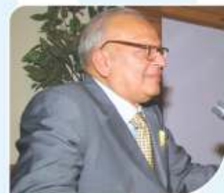
Hon'ble Justice A.K. Mathur Judge, Supreme Court of India