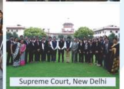
Supreme Court, New Delhi