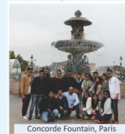
Concorde Fountain, Paris