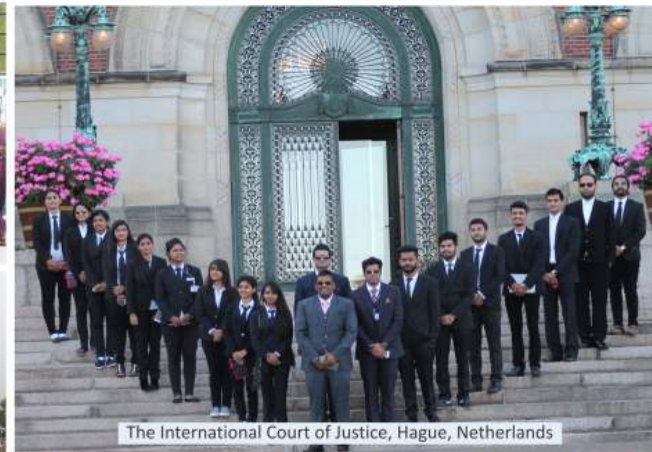
The International Court of Justice, Hague, Netherlands