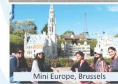
Mini Europe, Brussels